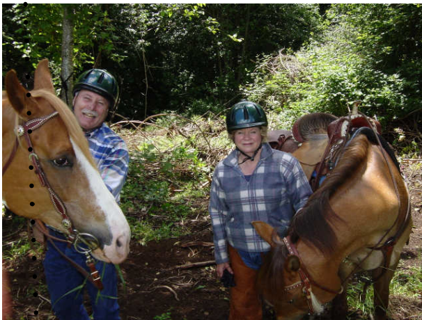
Lunch at The Falls