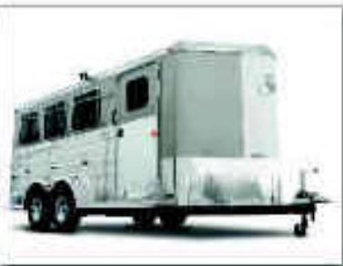
Come see the new line up of Logan Coach Aluminum Skin Horse Trailers!

Interstate Cargo Trailers Iron Eagle Utility Trailers Big Tex Equipment Trailers