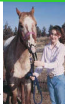
A nose twitch can safely restrain a horse without the use of sedatives

Before trying to use a twitch for the first time, ask a professional trainer or your veterinarian to show you the proper technique. No matter what, always use common sense and good horsemanship when applying a nose twitch.